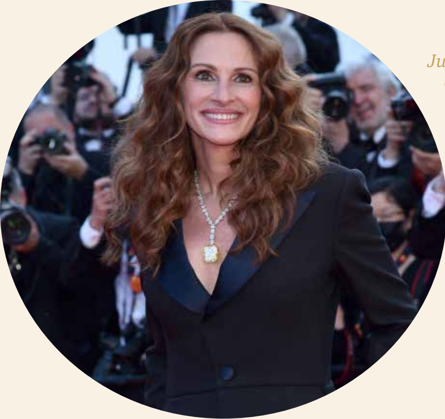
Julia Roberts in Louis Vuitton and Chopard jewels