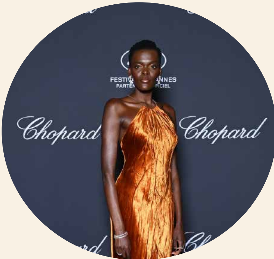
Sheila Atim in Prada