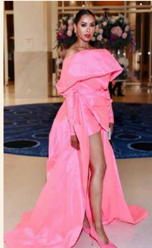
Kat Graham in Nicolas Jebran