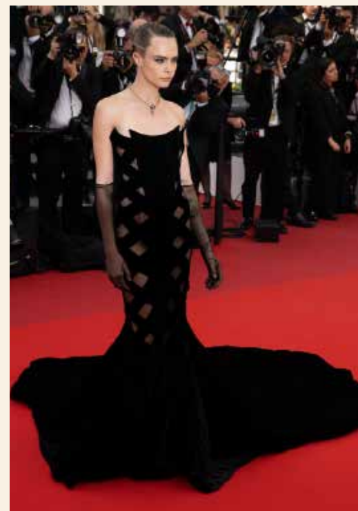
Cara Delevingne in Balmain