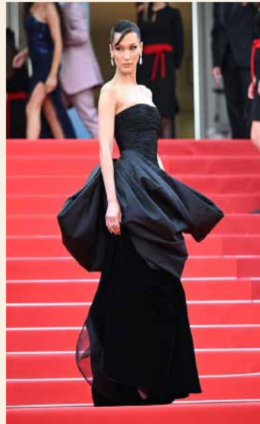
Bella Hadid in vintage Versace